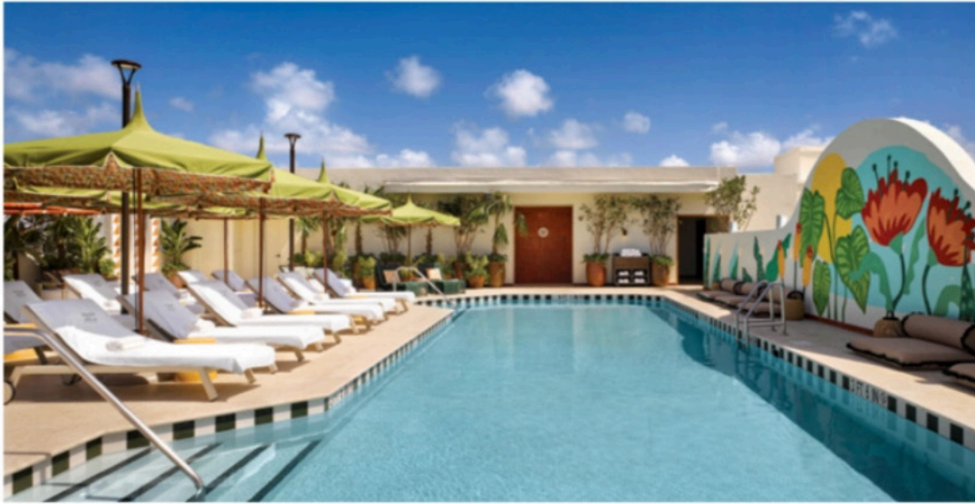
Sipsip And Rooftop Pool

The heart of Mayfair House Hotel & Garden is its vibrant and sun-filled courtyard and garden, filled with lush plantings, cascading fountains, beautiful pools, fanciful copper lighting, and sculptural architectural details. Guests access their rooms from the outdoor corridors that surround the garden, experiencing the green oasis by day and night. There is a hand-painted wall mural by Bahamian