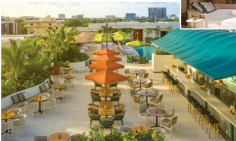
Sipsip Rooftop Bar